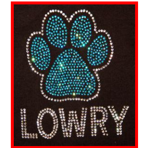
Lowry Paw Design