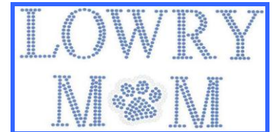
Lowry Mom Design

Please make checks payable to Lowry Elementary PTA. There will be a $20.00 fee for all returned checks.